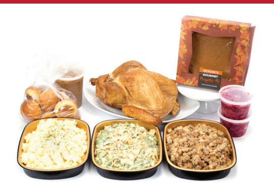
Meal for 10

Express orders require a 72 hour notice. Pick up fee of $5.95. Delivery not available.