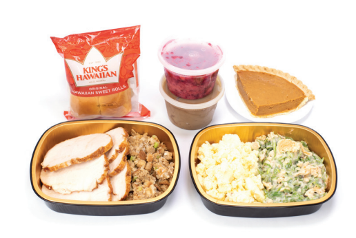
Meal for 2 $^{40}