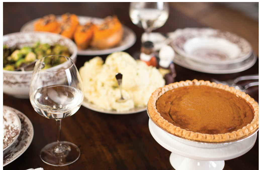
All holiday orders require a 48-hour notice.