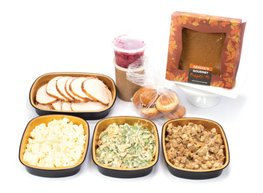
Meal for 6