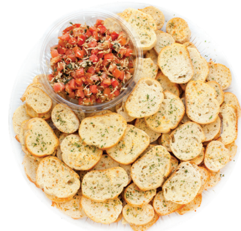
Bruschetta Tray 16" $34 (serves 20-25)