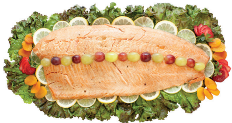
Smoked Salmon Fillet $19.99 lb avg weight 3-4 lbs