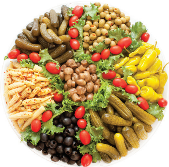
Relish Tray 12" $45, 16" $69