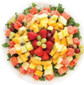
Fruit Kabobs $25 dozen, with a pineapple centerpiece $32 per dozen