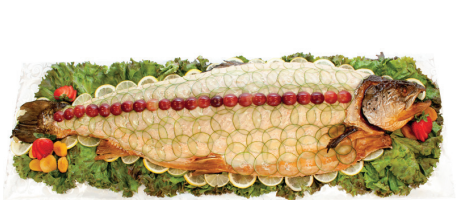
Whole Smoked Salmon $19.99 lb avg weight 7-8 lbs