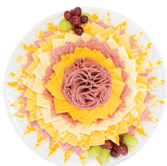
Cheese & Sausage Tray with Wellington Crackers 12" $69, 16" $89, 18" $99