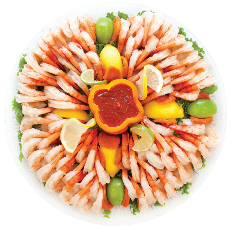
26/30 ct Jumbo Shrimp 50 ct $69, 100 ct $109