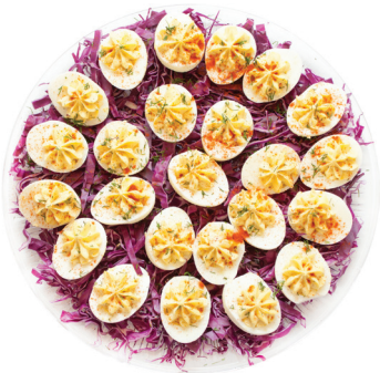
Deviled Eggs 12" (24) $39, 16" (36) $49, 18" (48) $59