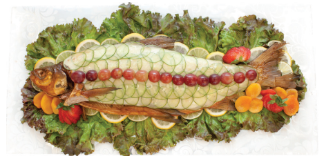
Whole Smoked Lake Trout $19.99 lb avg weight 3-5 lbs