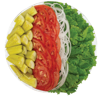
Top-It-Off Tray 12" $20, 16" $29, 18" $39