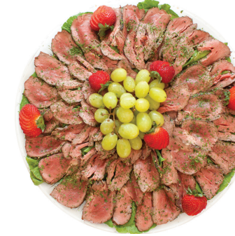
Tenderloin Tray 12" $65, 16" $89, 18" $119