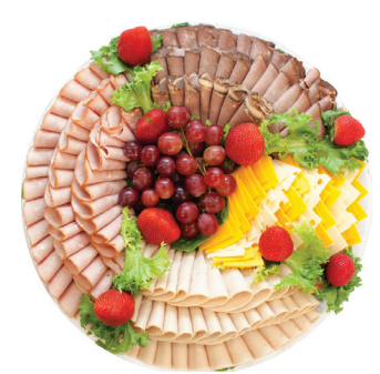
Deluxe Deli Meat & Cheese Tray 12" $65, 16" $89, 18" $109