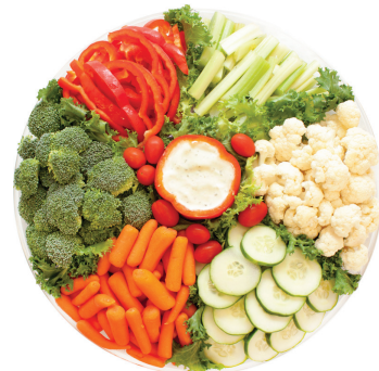
Fresh Vegetable & Dip Tray 12" $39, 16" $54, 18" $65 with dill or ranch dip