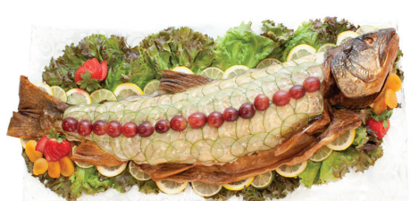
Whole Smoked Whitefish $16.99 lb avg weight 3-5 lbs

Ask one of our associates to help you create a custom order.