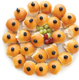
Cocktail Sandwiches with Condiments On The Side

Ham, Turkey or Beef $29 dozen Egg, Chicken or Tuna Salad $29 dozen Beef or Pork Tenderloin $36 dozen Add Cheese $4 dozen On Mini Croissants $4 dozen