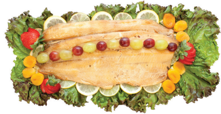
Smoked Whitefish Fillet $17.99 lb avg weight .75 - 1.25 lbs