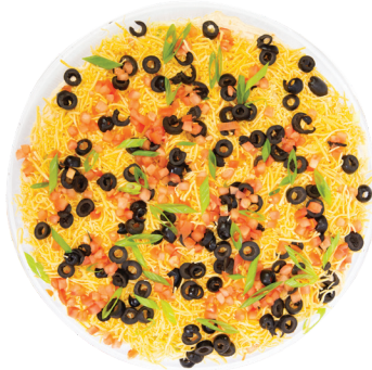
Classic Taco Dip Tray with Sendik's Tortilla Chips 12" $39, 16" $59, 18" $72