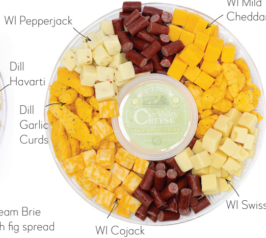
WI Pepperjack Dill Havarti Dill Garlic Curds WI Cojack WI Mild Cheddar WI Swiss