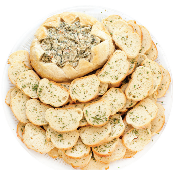
Stuffed Bread Bowl 12" $42, 16" $65, 18" $75 Choose from: Spinach or Crab Cracker Dip