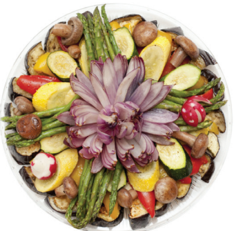
Roasted Fresh Vegetable Tray 16" $64