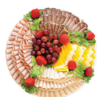
Deluxe Deli Meat & Cheese Tray 12" $65, 16" $89, 18" $109