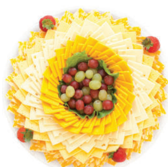
Classic Deli Cheese Tray with Wellington Crackers 12" $59, 16" $79, 18" $99