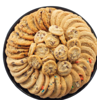
Sendik's Cookie Tray 20 ct $20, 40 ct $40,