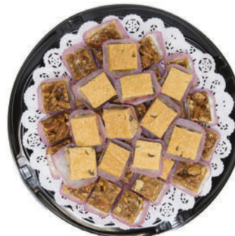
Sendik's Gluten Friendly Bar Tray 12" 40 ct $55