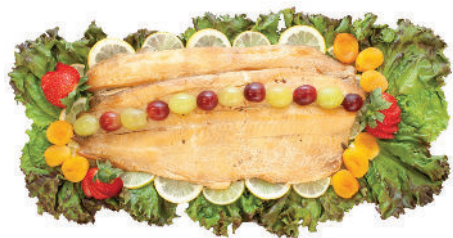
Smoked Whitefish Fillet $17.99 lb avg weight .75 - 1.25 lbs