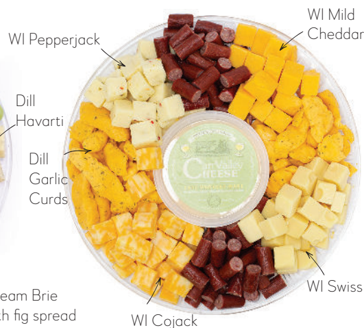
Wisconsin Classics Cheese Tray