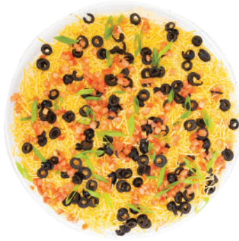
Classic Taco Dip Tray with Sendik's Tortilla Chips 12" $39, 16" $59, 18" $72