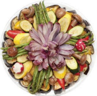
Roasted Fresh Vegetable Tray 16" $64