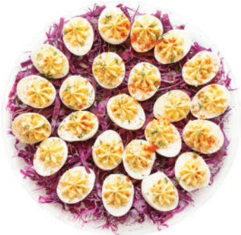
Deviled Eggs 12" (24) $39, 16" (36) $49, 18" (48) $59