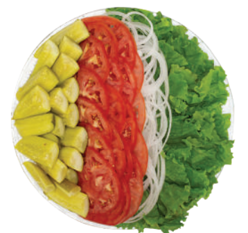
Top-It-Off Tray 12" $20, 16" $29, 18" $39