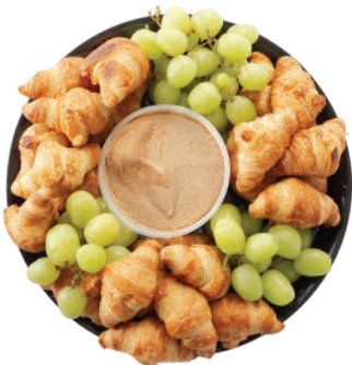
Sendik's Mini Croissant Tray 12" 24 ct $23