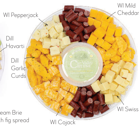
Wisconsin Classics Cheese Tray