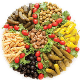
Relish Tray 12" $42, 16" $59