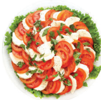
Capri Tray 12" $42