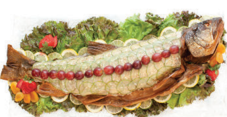
Whole Smoked Whitefish $16.99 lb avg weight 3-5 lbs

Ask one of our associates to help you create a custom order.