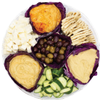
Mediterranean Hummus Tray 16" $64, 18" $79

Ham, Turkey or Beef Egg, Chicken or Tuna Salad Upgrade to Beef or Pork Tenderloin Add Cheese or upgrade to Mini Croissants