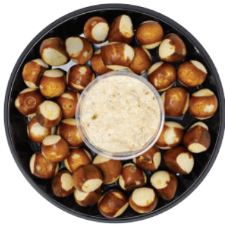
Pretzel Bites & Con Queso Dip Tray 12" $24, 16" $45