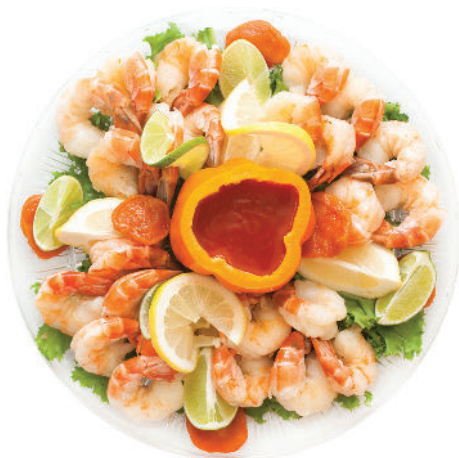
8/12 ct Super Colossal Shrimp 25 ct $92