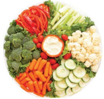
Fresh Vegetable & Dip Tray 12" $42, 16" $59, 18" $69 with dill or ranch dip