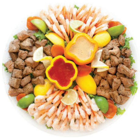
Smoked Salmon Nuggets & Jumbo Shrimp Platter 25 ct / 1 lb $75