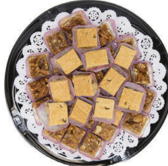
Sendik's Gluten Friendly Bar Tray 12" 40 ct $55