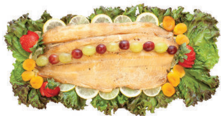
Smoked Whitefish Fillet $17.99 lb avg weight .75 - 1.25 lbs