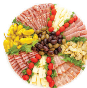
Antipasto Meat Tray 16" $79, 18" $109