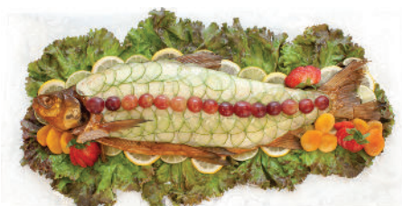
Whole Smoked Lake Trout $19.99 lb avg weight 3-5 lbs