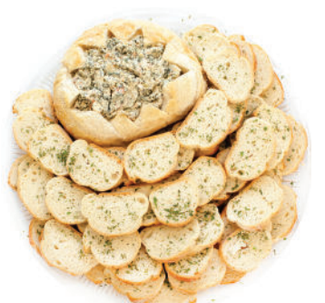
Stuffed Bread Bowl 12" $42, 16" $65, 18" $75 Choose from: Spinach or Crab Cracker Dip