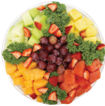
Signature Fruit Tray 12" $46, 16" $59, 18" $79