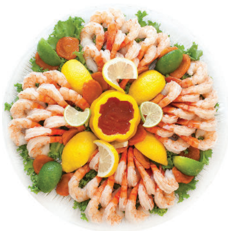
16/20 ct Colossal Shrimp 35 ct $64, 50 ct $84, 75 ct $114