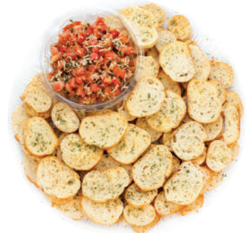
Bruschetta Tray 16" $39 (serves 20-25)