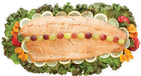
Smoked Salmon Fillet $19.99 lb avg weight 3-4 lbs