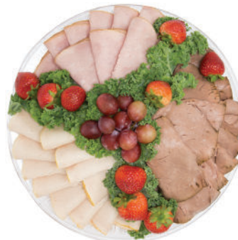
Premium Deli Meat Tray 12" $69, 16" $92, 18" $109