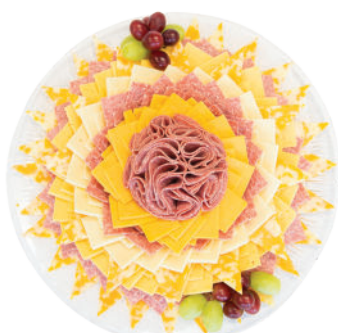
Cheese & Sausage Tray with Wellington Crackers 12" $72, 16" $92, 18" $109