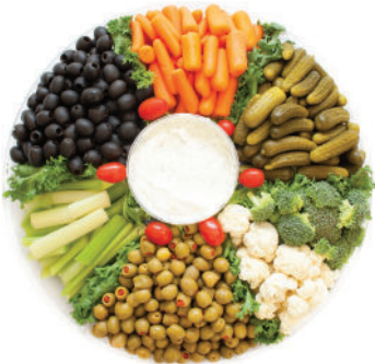
Vegetable & Relish Tray with Dip 12" $42, 16" $59 with dill or ranch dip