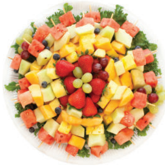
Fruit Kabobs $29 dozen, with a pineapple centerpiece $32 per dozen