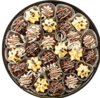
Sendik's Brownie Bite Tray 12" serves 15-25 $30, 16" serves 30-40 $60