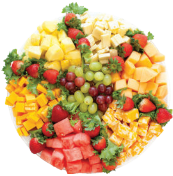
Fancy Fruit & Cheese Tray 12" $42, 16" $74, 18" $92