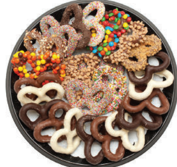
Sendik's Gourmet Pretzel Tray 24 ct $40