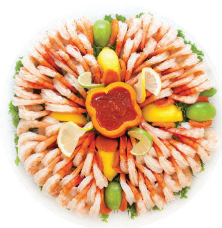
26/30 ct Jumbo Shrimp 50 ct $69, 100 ct $109