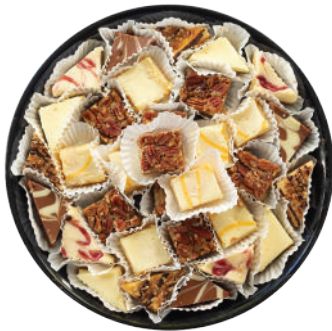
Sendik's Assorted Bar Tray 12" 32 ct $40, 16" 56 ct $65, 18" 80 ct $90.