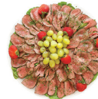
Tenderloin Tray 12" $72, 16" $109, 18" $124