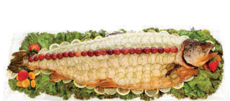
Whole Smoked Salmon $19.99 lb avg weight 7-8 lbs