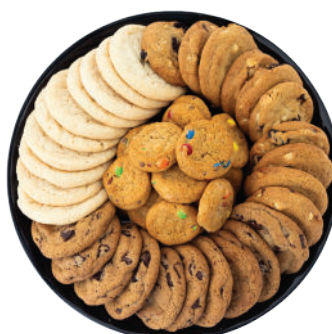
Sendik's Cookie Tray 27 ct $20, 54 ct $40,