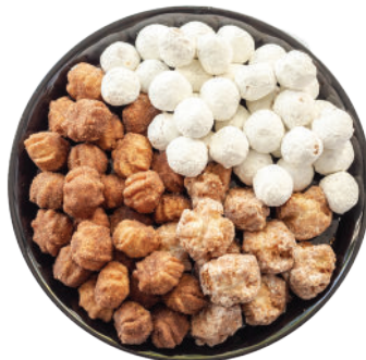
Sendik's Donut Hole Tray 12" 16 ct $23