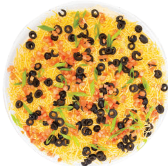
Classic Taco Dip Tray with Sendik's Tortilla Chips 12" $39, 16" $59, 18" $72