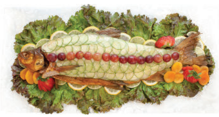
Whole Smoked Lake Trout $19.99 lb avg weight 3-5 lbs